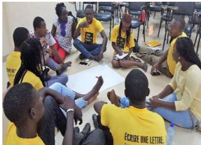
AI Burkina Faso youth members at a campaign training in Ouagadougou

Members in Bobo Dioulasso organized a “Night of Human rights” in commemoration of the 70th anniversary of the UDHR. They mobilized over 150 people and used storytelling, music, drama, film projection to raise awareness about human rights and the UDHR.