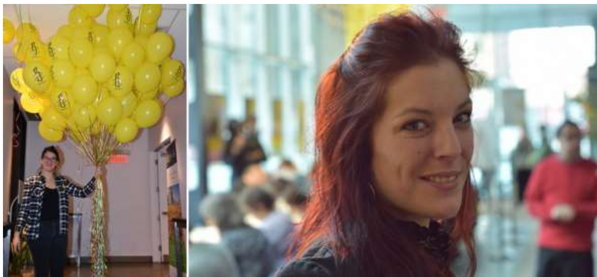
Activities at A Canada (FR) national office.

Amnesty Canada French speaking (FR) worked on ten cases during their 2018 Write for Rights campaign. These included the eight proposed by the International Secretariat, one proposed by the US section, AWAD, a human rights defender and refugee and the case of Amal Fathy in Egypt. Numerous activities and events involving music were organised, with many partners promoting and participating, including feminist organisations, community groups, and the major school board of the province of Québec. A special activity was also held in numerous libraries.