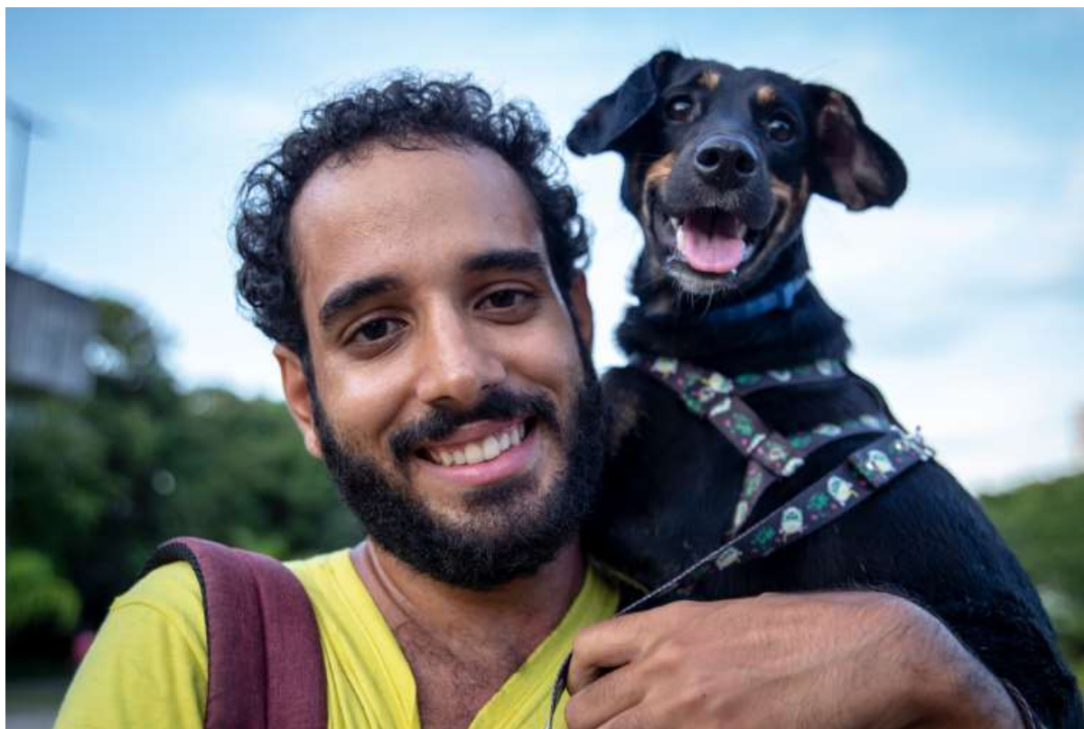
Amnesty Brazil Youth member (and his dog) from Salvador, at an event for the campaign

The Section acquired 235 new supporters because of W4R actions, who became regular monthly donors following the campaign.