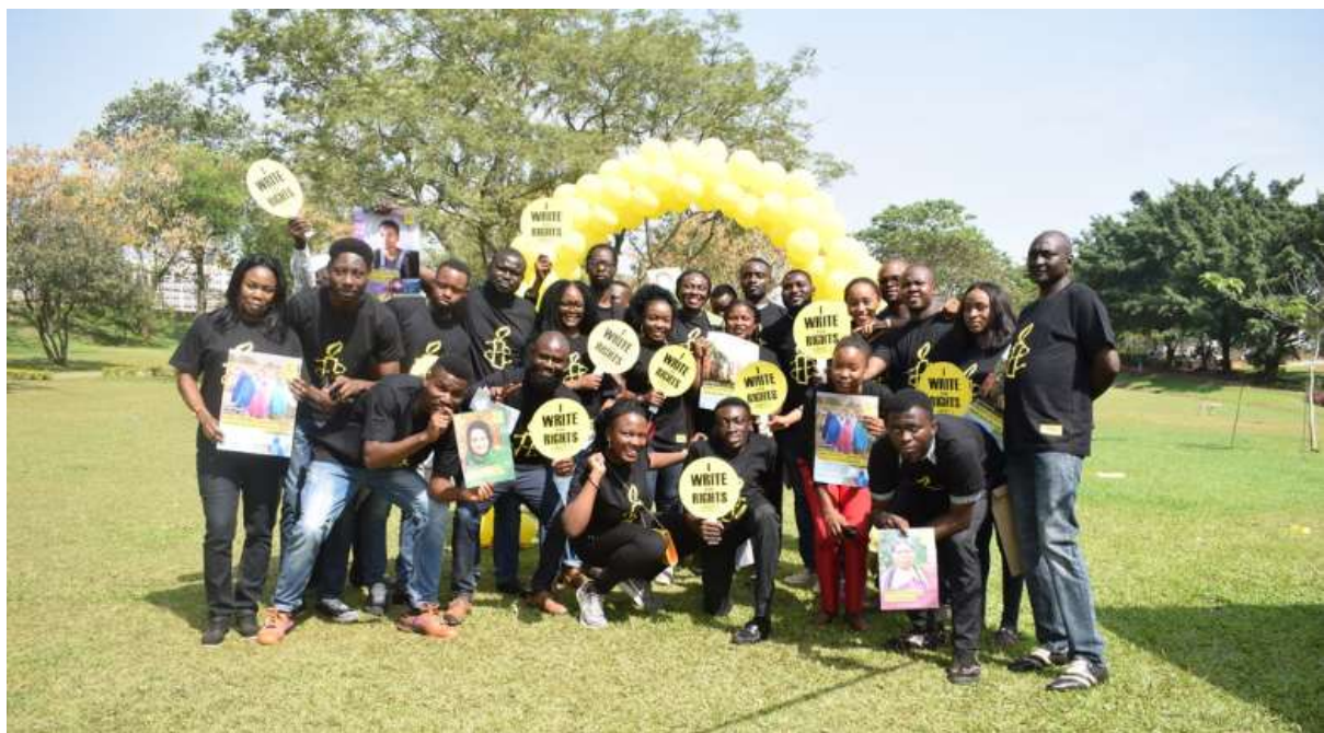
2018 Write for Rights even with AI Nigeria

Write for rights in Nigeria commenced with a national launch on 1 December. Thereafter, a total number of 23 events took place in sixteen (16) states across the country. Activists and supporters of Amnesty International in Nigeria and the public gathered in various events to write letters and sign petitions in solidarity with women human right defenders. Highlights of events ranged from friendly football matches, solidarity walks, youth neighbourhood gatherings, to write for rights action at a Nigerian law school. 10,457 actions were taken in support of cases from Kenya, Morocco, India, South Africa, Iran, and Brazil. As part of measures taken by AI Nigeria to bring Write for Rights global campaign closer to the ground in terms of national relevance the case of Knifar women was also promoted. The case gathered 3,572 actions. The facilitation of the various events across the states by coordinators of AI Nigeria supporters group was helpful in ensuring the success of the events. Collaboration with youth groups particularly the Young African Leaders Initiative (YALI Network) which is popular across Nigeria also helped. For example, in some states they offered their venues free to AIN supporters for Write for Rights. The solidarity walk in Nigeria's capital city was a first-time initiative which created more awareness and participation at the Write for Rights events.