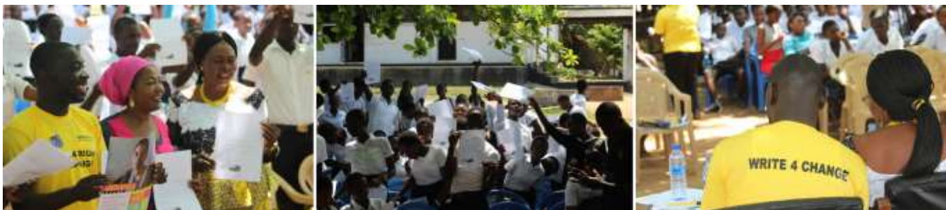
Activists at the launch event for Write for Rights in on 16th November, at Accra High School, Ghana

Youth activists were very involved, both at the National/Regional/Zonal, School and Group levels. The use of the Human Rights Friendly schools was by far the greatest tool for the Section and the campaign.