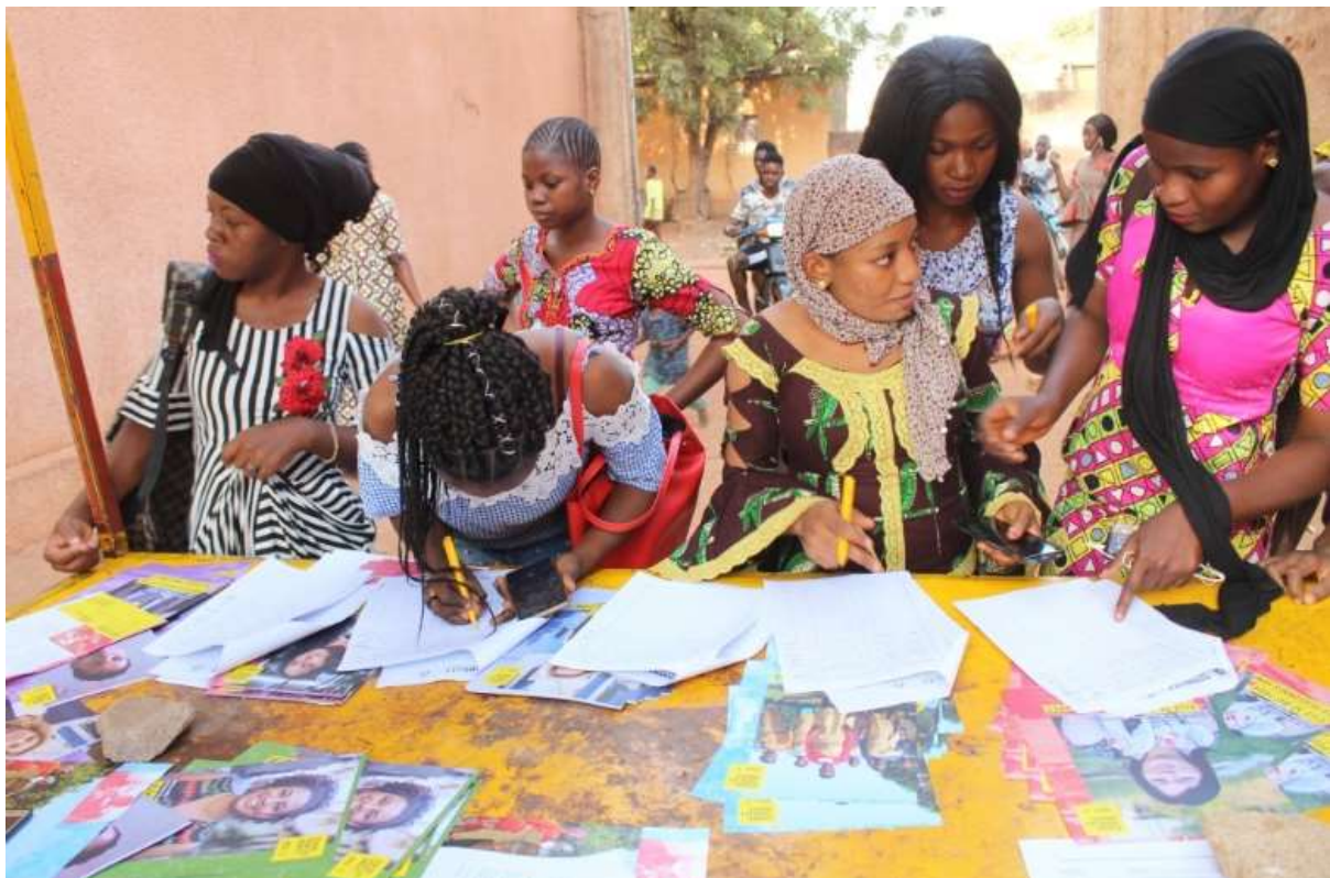
Amnesty International Mali activists and supporters take part in the 2018 Write for Rights letter writing campaign, Mali, December 2018.

Amnesty Mali more than tripled their action number compared to 2017.