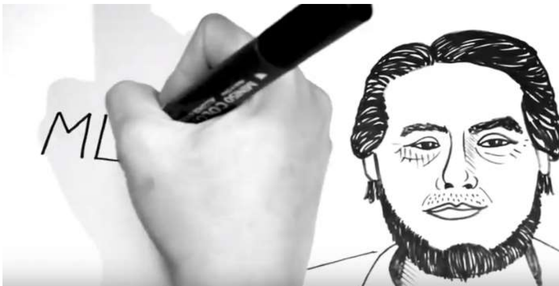
Still from a video advertising a human rights film festival in Mexico.

In terms of signatures, although offline has increased considerably (1,990 more than in 2017); digital has been much lower than in 2017 (10,430 vs 2018 (2,569). This is clearly due to the significant reduction in budget that took place in the middle of the year, which meant insufficient amounts for digital lead generation strategies. However, it is also positive that all digital signatures were organic.