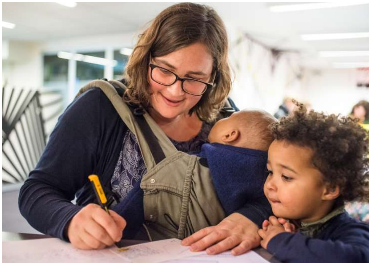
Write for Rights kick-off event in Antwerp, Belgium.

Our campaign was covered on local and national TV and radio (interviews with Teodora and Vitalina).