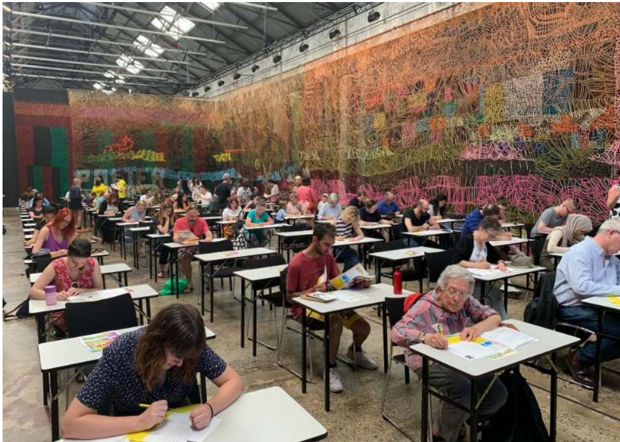
Participants write letters as part of a collaboration between Amnesty International, art gallery Carriageworks, and Nick Cave on Human Rights Day, 10 December 2019.

Media coverage of Write for Rights events and the anniversary of the Universal Declaration of Human Rights reached a potential audience of 550,000.