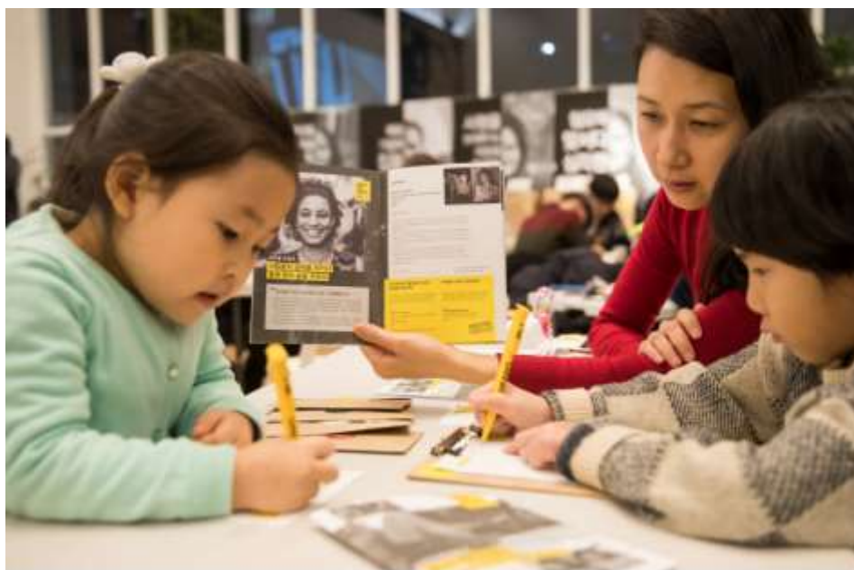
Children learning about, and writing letters for, Marielle Franco, one of the cases featured in the Write for Rights campaign, at an event hosted by Amnesty Korea in Seoul, South Korea.

Amnesty South Korea (AIK) approached the campaign in three ways. Firstly, via a microsite. The site had increased efficiency for participation by setting up a user journey that minimizes people leaving. Users could write a letter online, with multiple choices of contents. The petition was completed, people added an image with the W4R case’s faces and participants’ faces and shared it. Through strategic micro-site construction, the Section’s support base expanded, and 30,219 signatures were collected.