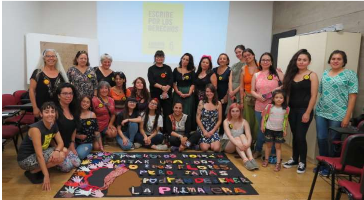
Activists take part in a Write for Rights event held by AI Chile.

Finally, thanks to the extra funds of the IS, the Section closed the campaign with the Recital Ellas Cantan for Human Rights, in which two famous Chilean singers participated free of charge, which brought together a large audience of all ages. This coincided with the commemoration of International Migrants Day, establishing interesting alliances with organizations for the rights of migrants, and holding a joint activism day that also allowed us to reach a new, larger and multicultural public.