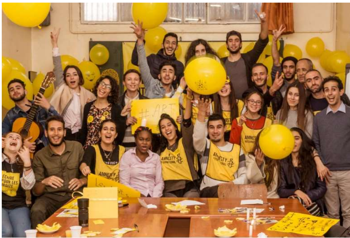
Supporters and members of Amnesty International Algeria take part in events for Write for Rights 2018, December 2018.

12 activities were conducted, in collaboration with local associations and also local authorities, "strengthen the work of collaboration with local associations" is an objective that was set during the elaboration of the guidelines of the growth and activism 2016-2019