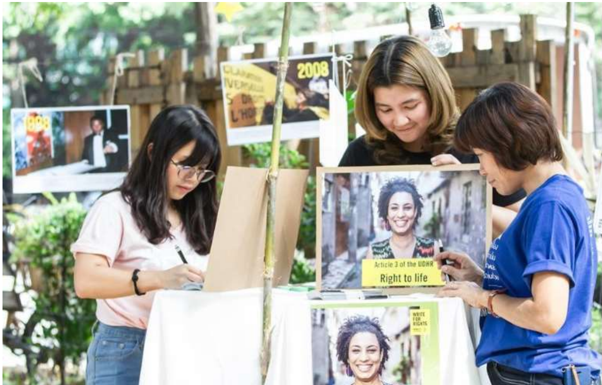
Write for Rights 2018 event in Thailand

A highlight this year was a design thinking workshop aimed at putting an innovative spin on Write for Rights. Many creative ideas were developed during the workshop. This proved a success for Amnesty Thailand in engaging with a new audience and it raised exciting opportunities for future campaigns. The section also set up booths in markets and parks, and as part of other events by Amnesty Thailand or their partners’.