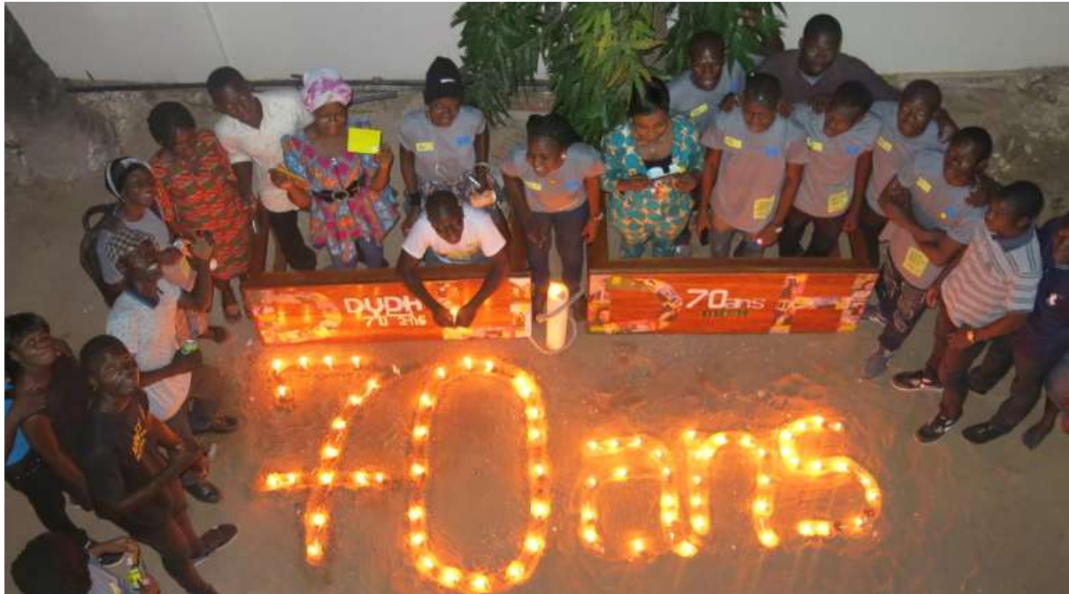
Write for Rights and 70th Anniversary of the UDHR event in Togo.

In 2018 the Section again increased their numbers of actions, with over 40,000 more signatures in 2018 as compared to 2017.