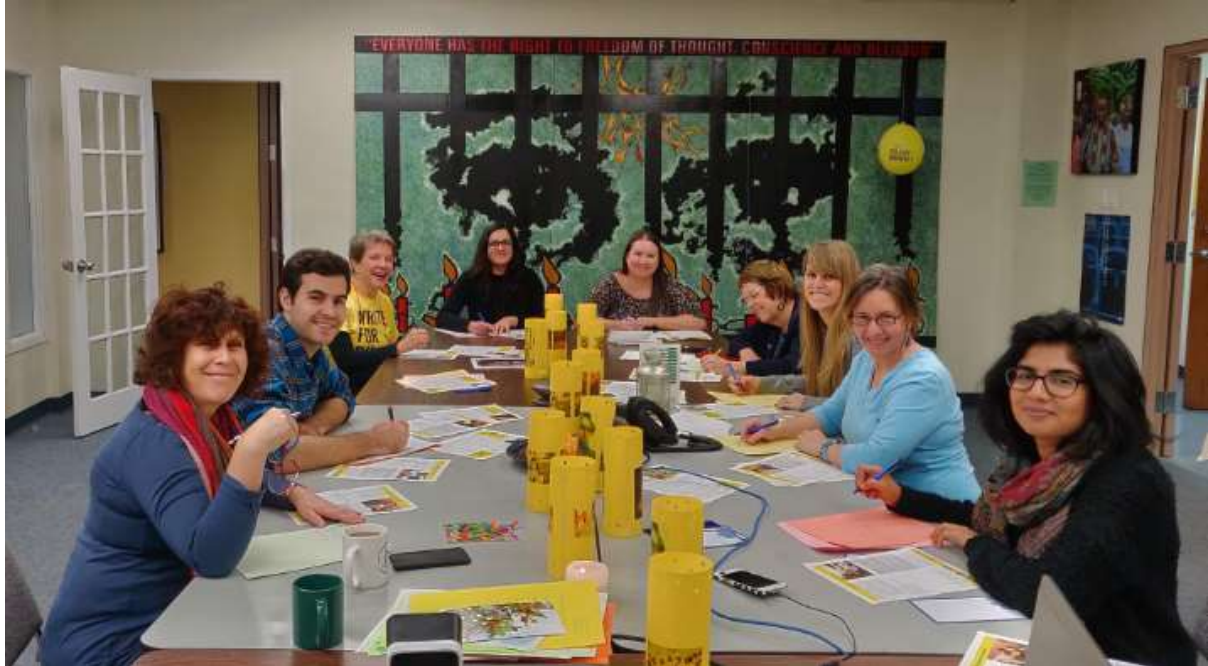
Toronto staff: Amnesty staff in Toronto, Canada participate in Write for Rights over lunch on December 10, 2018

They also piloted a new peer-to-peer fundraising platform to allow our board and community members to engage in fundraising on Write for Rights cases. We will expand our use of this platform in the future.