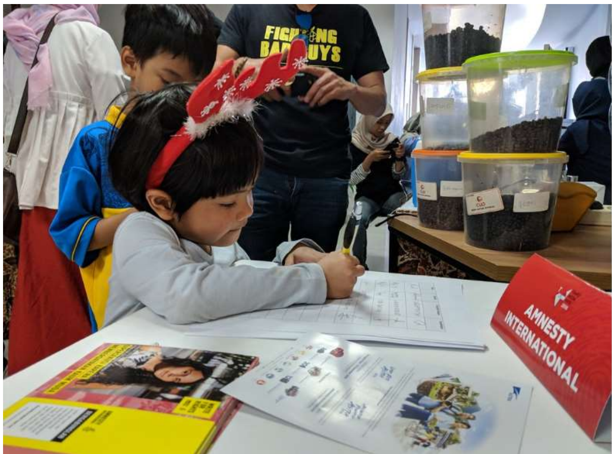
Supporters and members of Amnesty International Indonesia take part in events for Write for Rights 2018, December 2018.

In Aceh, with an organization called Rumoh Transparansi, the Section held a campus visit and coffee shop visit. In Cirebon, with an organization called SOFI Institute, the Section held a discussion about human right defenders. In Purwokerto, with an organization called Bhinneka Ceria, the Section held an event called “Malam Kebudayaan” which is a cultural night. In Kupang, with an organization called Bengkel APPEK, the Section held a road show to several university and organization in Kupang. In Makassar, with an organization called Korps Mahasiswa Ilmu Komunikasi or “KOSMIK”, the Section held a discussion, talk, and book fair. This event was held at the University Hasanuddin.