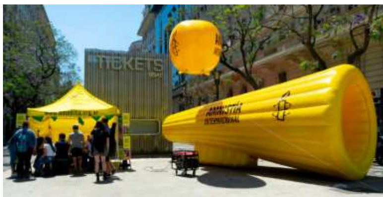
Public action by Amnesty International Argentina

Human Rights Education workshops were held in different schools for students to join the campaign. In addition, they conducted workshops with participatory methodologies for young people in the section, who became actively involved and wrote their own letters, inspiring other young people to join.