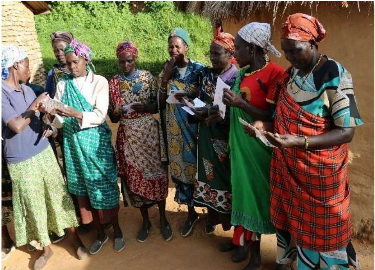
Women from the Sengwer Indigenous community look at solidarity cards sent to them from around the world as part of the Write for Rights 2018 campaign. Embobut Forest, Kenya

Even though there has been no direct government response to the campaign, continued campaigning and advocacy are important to ensure the case objectives are met. The community deserve to have their rights respected.