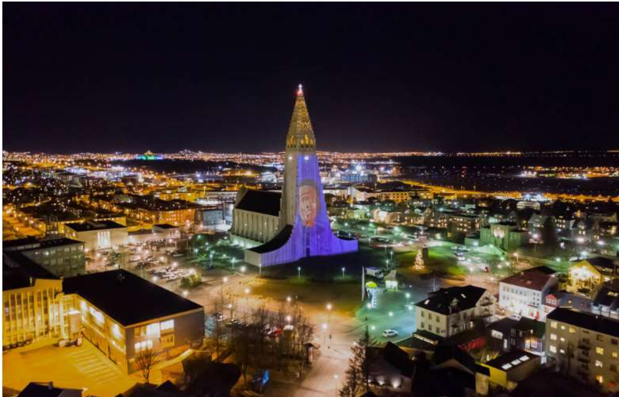
Light up the dark event in Iceland and collaboration with Icelandic Bus company

AI Iceland launched a new Write for Rights website which proved to be a great success. They saw a 16% increase in users visiting the Amnesty website this year and a 33% increase of page views. Around 60,000 signatures were collected on the website alone.