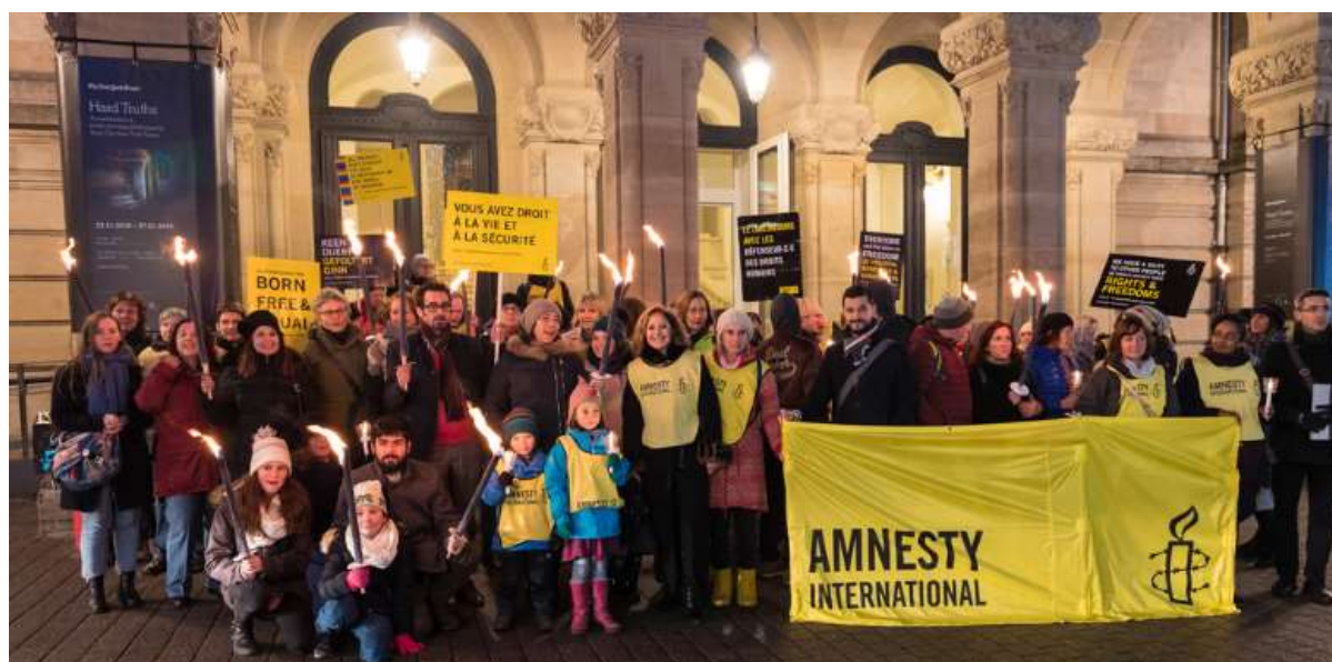
10th December march and writing letter event in Luxembourg

As in previous years, the Write for Rights campaign was a strong moment for schools and youth activists. The student’s actions account for nearly half of the collected actions.