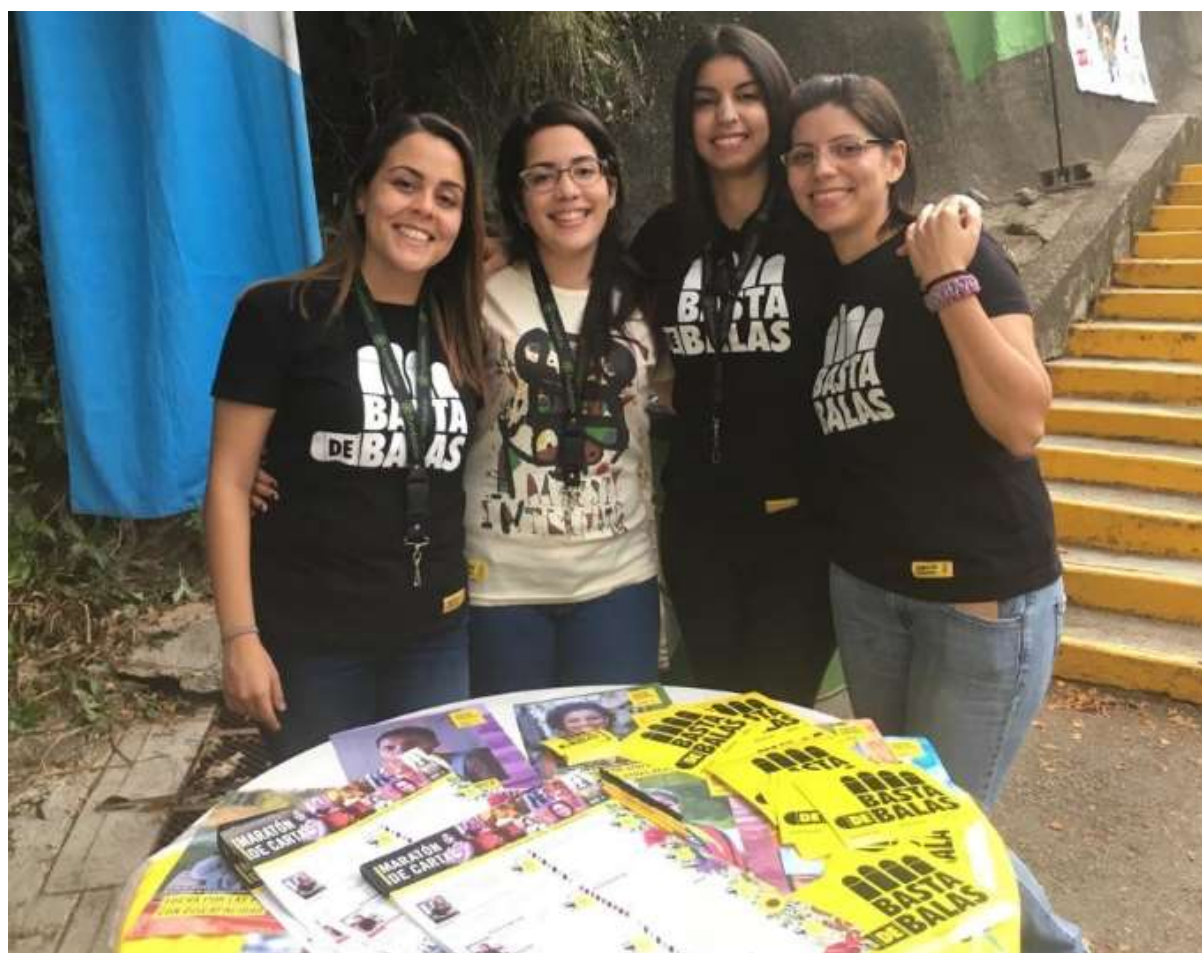
Young activists in Venezuela

The Women's Network promoted various activities, with actions carried out in different spaces such as plazas, theatres and at places like concerts, dances. The Section worked with young female influencers on social media, they supported the campaign and promoted the importance of human rights defenders and highlighted the attacks and violations faced by defenders throughout the world.