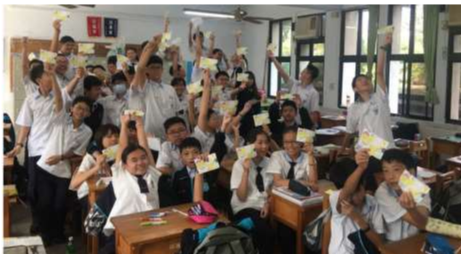
A school in Taiwan takes part in Write for Rights

Besides schools, the Section held seven W4R events all over Taiwan, with people writing solidarity letters. AI Taiwan also invited people to sign petitions through face-to-face, inviting individuals, university groups and local groups to join and also hold their own W4R parties. In 2018 there were 393 schools, 650 teachers, 76,576 young students, 44,093 individuals taking action, while 2,496 people signed the petition online. The Section provided certificate and little gifts (W4R stickers and pens) for teachers, students and individuals who registered to hold their own W4R parties. People from all around Taiwan joined the movement, even the ones from offshore islands, and they can see that W4R impact has the potential to grow unlimitedly.