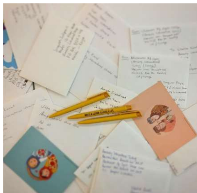
Letters written by AI Turkey for Write for Rights

Open calls were made through social media; Instagram, Facebook and Twitter and call for action mailings were sent to activists and supporters.