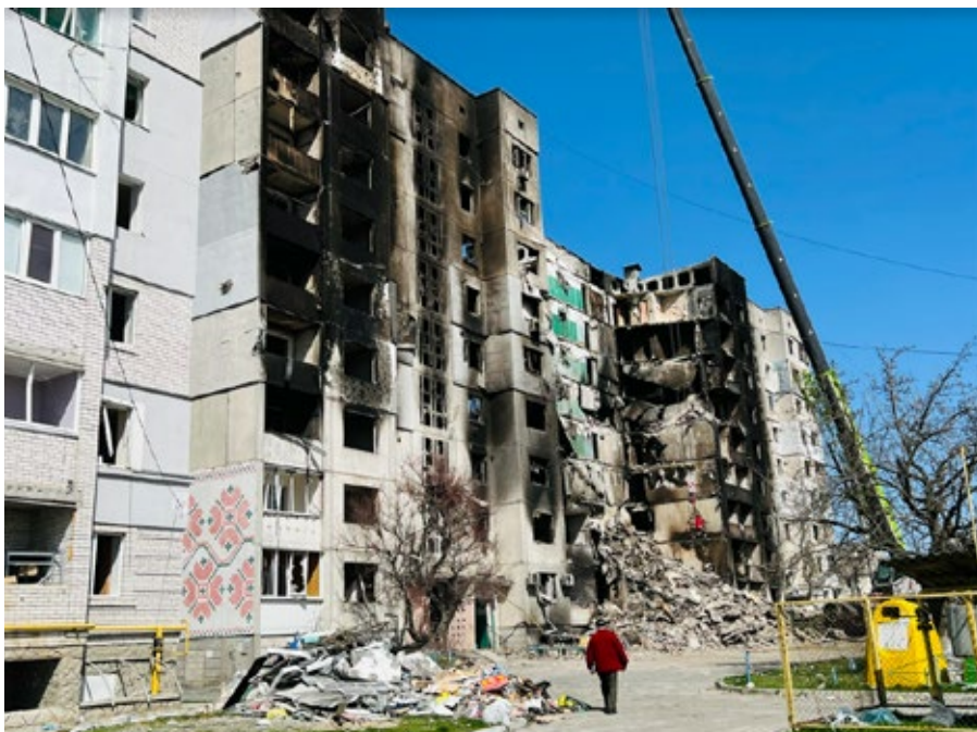
👁️ ← Building 353, which was bombed on 2nd March 2022 in Borodyanka.

buildings further down the road the previous evening, but that his mother had refused to leave.