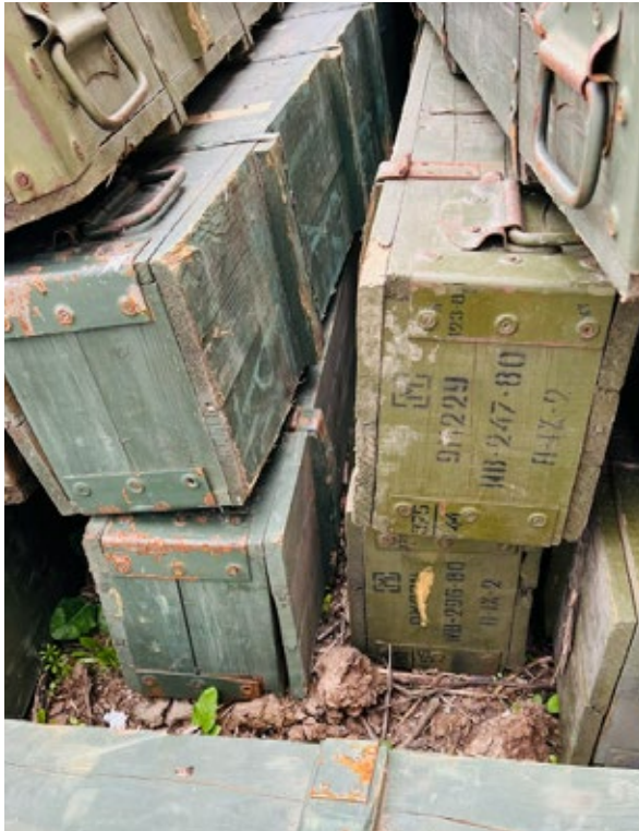
👁️ ↑ Boxes of munitions

International that they left it on 3 March and when they returned on 7 April they found the body of the woman slumped on the floor of the cellar. They said her body was naked and wrapped in a fur coat; part of her head was missing, and she had open wounds on the front of her thighs, abdomen and upper chest. She was later identified. 11