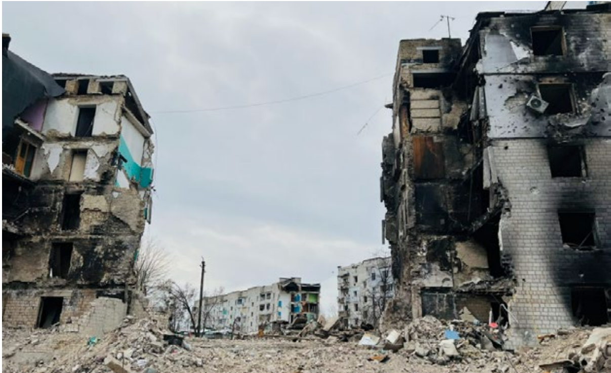
⦿ ↑ Buildings 429 and 429A which were bombed on the 1st of March 2022 in Borodyanka.