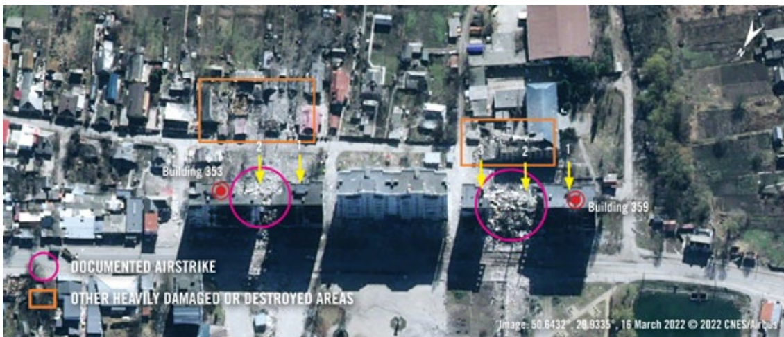
☉ ↑ Satellite imagery from 14 October 2019, shows buildings 353 and 359. The relevant entrances to the buildings have been marked. On 16 March 2022, satellite imagery shows destruction from two documented airstrikes and other heavily damaged or destroyed areas nearby. Cloud cover prevented a clear view of this area in imagery from 27 February 2022.