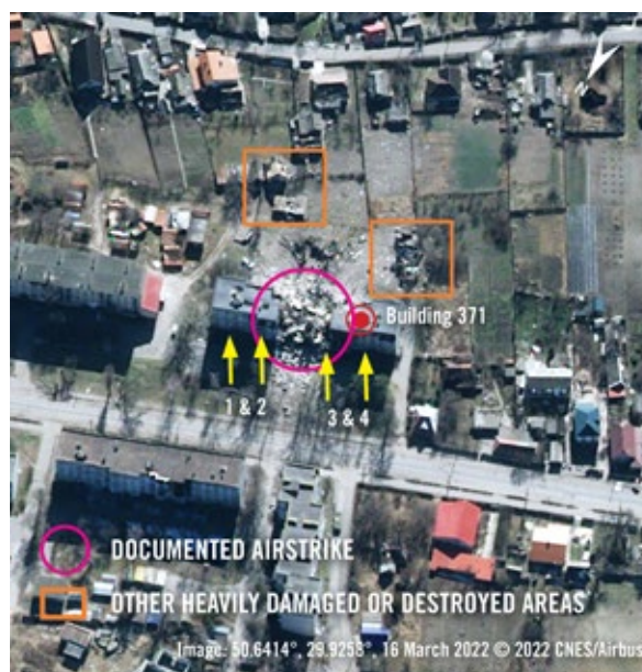
↑ Satellite imagery from 14 October 2019, shows building 371. The relevant entrances to the building have been marked. On 16 March 2022, satellite imagery shows destruction from a documented airstrike and other heavily damaged areas nearby. No large military objects were readily visible in imagery from 27 February 2022 (not shown).

metres down the street from the first buildings that were hit. Among those killed in that attack were Vitaliy Smishchuk, a 39-year-old surgeon, his wife Tatiana, in her mid-thirties, and their four-year-old daughter Yeva. Vitaliy’s mother recalled: