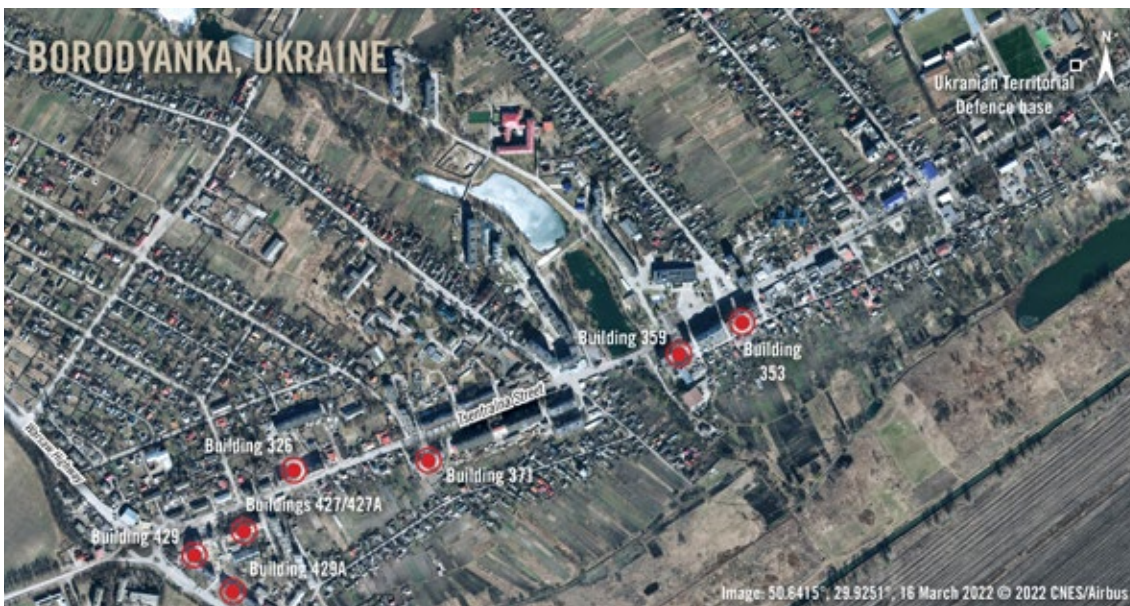
☉ ↑ Satellite imagery from 16 March 2022, shows the Borodyanka area where airstrikes to buildings were documented. The buildings are highlighted on the map.